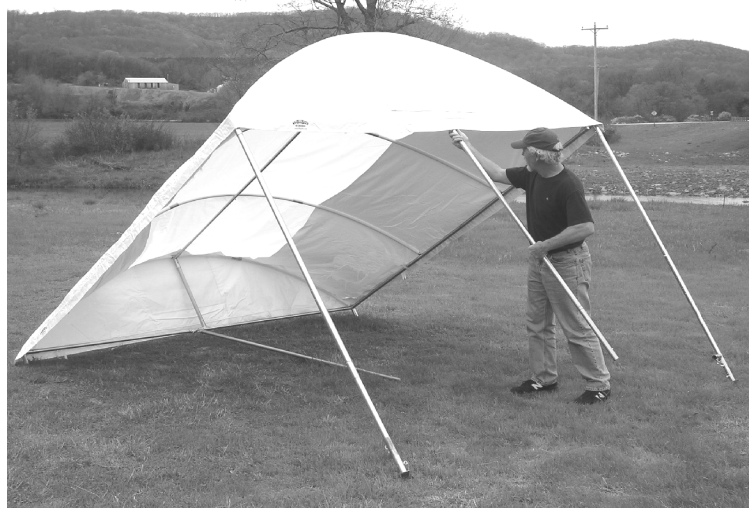
Front legs attached, removing the leg Pole

10. The back of the canopy can now be lifted, letting the EasyRiser pole swing into a vertical position to support the top while you attach the back legs. Remove the EasyRiser pole after the legs are in place and swivel the StaBar Ell out of the way.