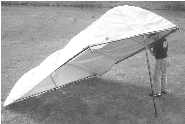
Canopy roof raised and supported on “collapsed” leg pole

9. Before raising the canopy onto it's back legs, step inside and secure the top to the frame as described in the TrimLine instructions.