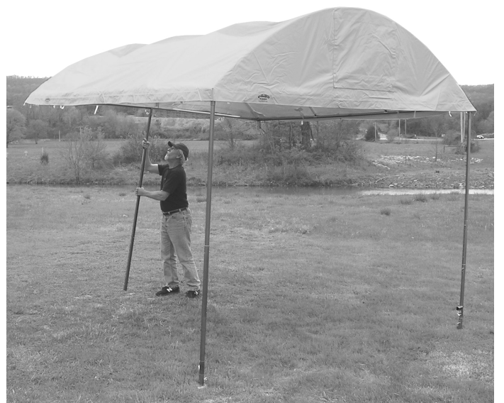
Pushing frame up using the rear EasyRiser pole

12. To take the canopy down: Lower the legs to their “collapsed” position. Reinstall the rear EasyRiser pole and remove rear legs first, then remove EasyRiser pole and lower frame to the ground. Repeat at the front, using a leg pole.