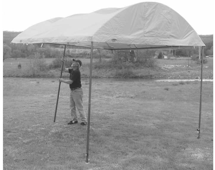
Pushing rear edge of frame up using leg

9. To take the canopy down: After removing all StaBars, move the Rear Leg back to the Door Ell on the rear wall and remove rear corner legs. Lower back edge of canopy carefully and remove Rear Leg. Repeat at the front edge, lowering the roof frame to ground.