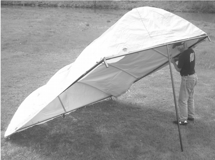
Canopy roof raised and supported on leg

6. Insert two of the legs into the front Corner Joints. You may choose to install the telescoping legs in their extended position, or you may install them in the collapsed position and extend them one at a time once they are all in place. Remove Leg you used to prop the canopy and move it into it's final position at the 4-way joint with rafter base. Swivel the Door Ell up out of the way, securing it with the thumbscrew.