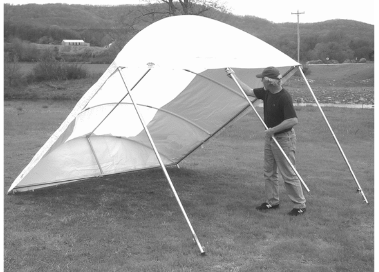
Front legs attached, removing the leg

7. Now insert a Leg into Door Ell at the rear edge of the roof frame. Lift the back edge of the canopy, allowing leg to swing into place to support roof while you attach the remaining two legs. You may need to use the support Leg itself to push the frame all the way to it's full height.